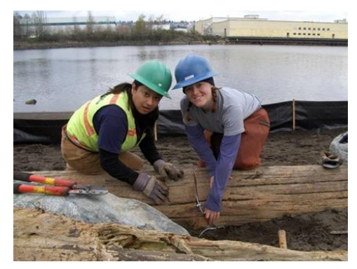
The Green-Duwamish UWFP will help reconnect people to their urban waterways by identifying opportunities for citizen-based stewardship.

Throughout the Green-Duwamish watershed, community organizations, local and county governments, tribal governments and communities, and regional non-profit organizations work to address these and other aspects of environmental justice.