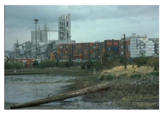
The Duwamish River flows through port facilities, manufacturing plants, chemical and solid waste recycling companies, ship repair yards, and numerous combined sewer outfalls.

Subsequently, a joint effort between federal agencies was formed to help coordinate the work of the federal government and integrate it with the work of state agencies, tribes, local governments, and others through the PSP. The resulting partnership, called the Puget Sound Federal Caucus (PSFC), includes 14 agencies, and is led by the EPA. The PSFC worked with the